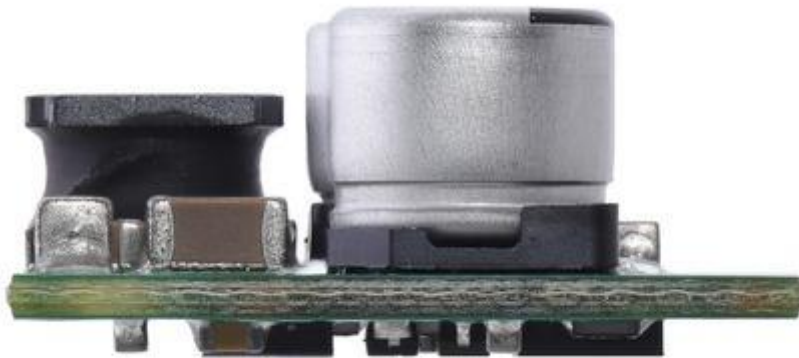
Pololu Step-Down Voltage Regulator D24V22Fx, side view.

The board has two 0.086" (2.18 mm) diameter mounting holes intended for #2 or M2 screws. The mounting holes are at opposite corners of the board and are separated by 0.52" (13.21 mm) both horizontally and vertically. For all the board dimensions, see the dimension diagram (204k pdf).