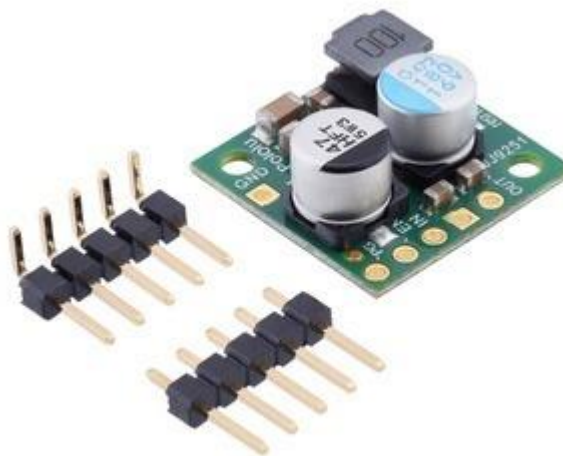
Pololu Step-Down Voltage Regulator D24V22Fx with included hardware.

The “power good” indicator, PG , is an open-drain output that goes low when the regulator’s output voltage falls below around 85% of the nominal voltage and becomes high-impedance when the output voltage rises above around 90%. An external pull-up resistor is required to use this pin.