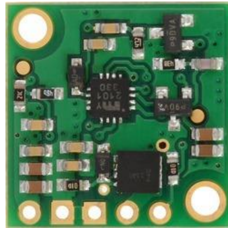
Pololu 2.5A Step-Down Voltage Regulator D24V25Fx, bottom view.

The five connection points are labeled on the top of the PCB and are arranged with a 0.1" spacing for compatibility with solderless breadboards, connectors, and other prototyping arrangements that use a 0.1" grid. Either the included 5x1 straight male header strip or the 5x1 right angle male header strip can be soldered into these holes. For the most compact installation, you can solder wires directly to the board.