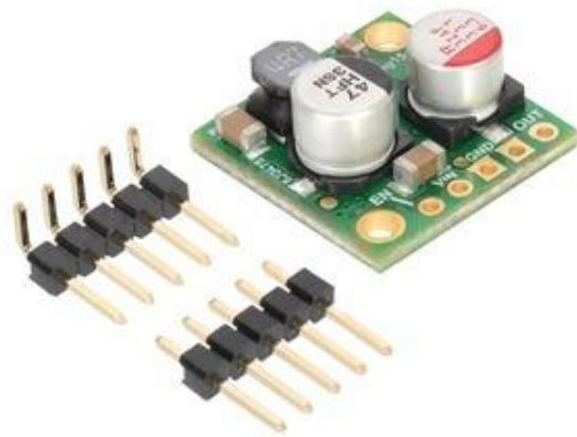
Pololu 2.5A Step-Down Voltage Regulator D24V25Fx with included hardware.

0.6 V) to put the board into a low-power state. The quiescent current draw in this sleep mode is dominated by the current in the pull-up resistor from ENABLE to VIN and by the reverse-voltage protection circuit, which will draw between 10 \mu A and 20 \mu A per volt on VIN when ENABLE is held low. If you do not need this feature, you should leave the ENABLE pin disconnected.