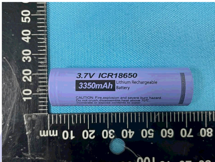
Photo 1 Front 正面