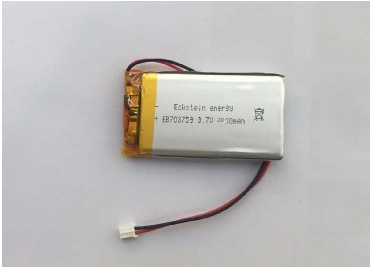
The BOM of cell group